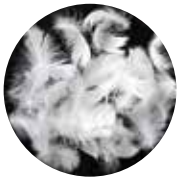
Down &amp; Feather