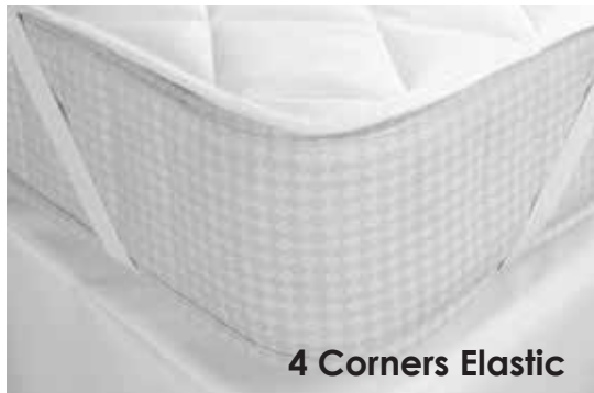
4 Corners Elastic